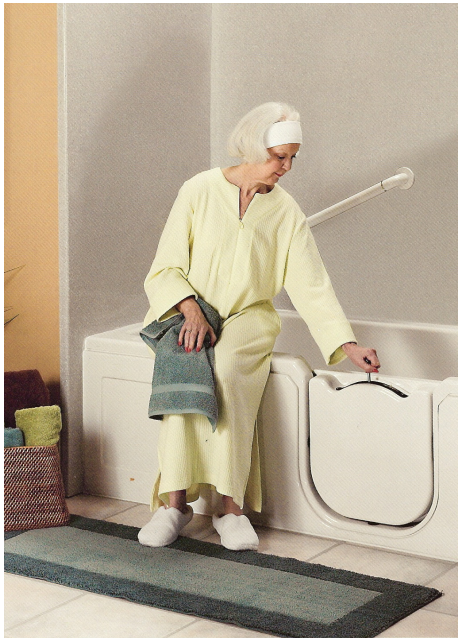
← Luxury Bath Systems' tub measures 60"x32"x21". It fits in the standard space of a normal tub has whirlpool and heater features. The only difference from the normal 14" tub height is the 21" It has a seat in the back area. Mom will even find it convenient for bathing small children.

safety feature is the ability to adjust the temperature before even turning on the water. This is helpful for the youngsters and oldsters. There are several varieties of this "door style tub". The one at the left is much like a normal tub in size and height. Others are much taller, featuring an upright sitting position. Still others have seats that raise and lower the bather eliminating the struggle of trying to stand up from a sitting position.