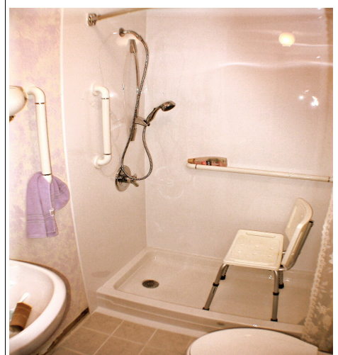
TUB TO SHOWER CONVERSION Actual picture of a recent project illustrating substituting the tub for a shower without using any more floor space.

The whole process takes about three consecutive days and can be used the following day after completion. This is the most flexible option providing the entire family with plenty of bathing room.